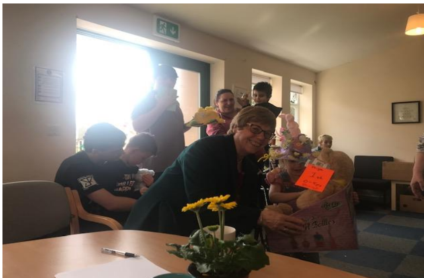
Meeting residents at the Three Closes.

Met the police at some of their regular surgeries raised issue of youth anti-social behaviour and speeding on Braddon Road.