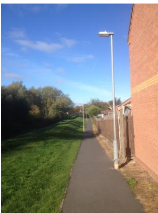
Black Brook Way, Dishley, Keeping footways clean and safe

Continue to hold street surgeries with Loughborough North Borough Councillors. These walkabout surgeries are an effective way of picking issues